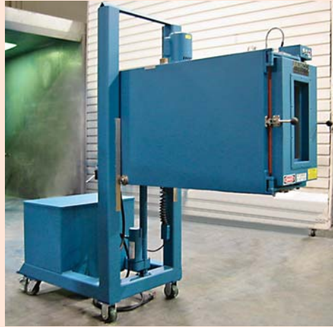
Bemco FTU3.2-184X538C with counterbalance stand and large window. This unit uses LN 2 for cooling.

Front Loading Straddle (4), often specified when rear loading is inconvenient.