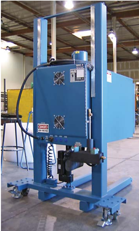
Bemco FTU3.2-73/316C with Electric Lift

Standard heating and cooling time on -73 to 316 C chambers from 23 C to -73 C and from 23 C to + 316 C (-100 to +600 F) is 30 minutes. Standard time for -184 to +638 C (-300 to +1000 F) chambers is 60 minutes.